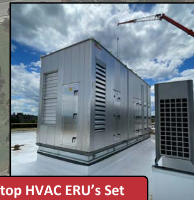
Rooftop HVAC ERU's Set