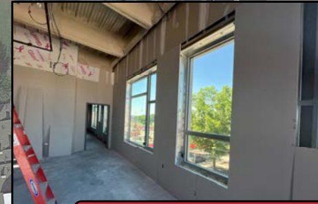
Start of Drywall Install - Level 3

Interior – https://vimeo.com/954065173/0d5b634a4e?share=copy