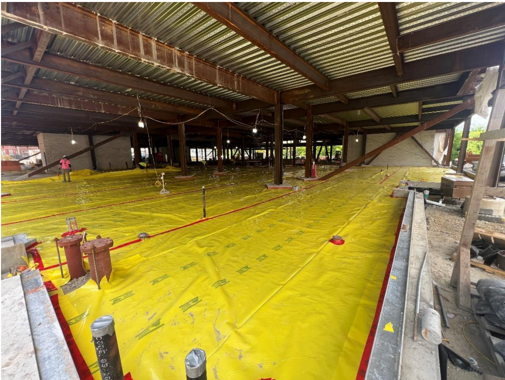
Kindergarten, under slab vapor barrier