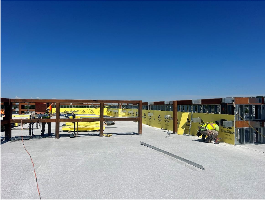
Roof, infill framing between parapet steel