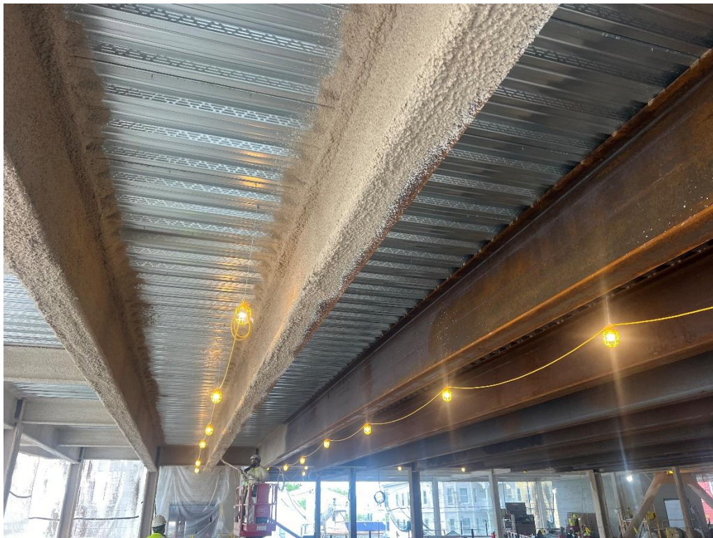
Level 2 Fireproofing spray application